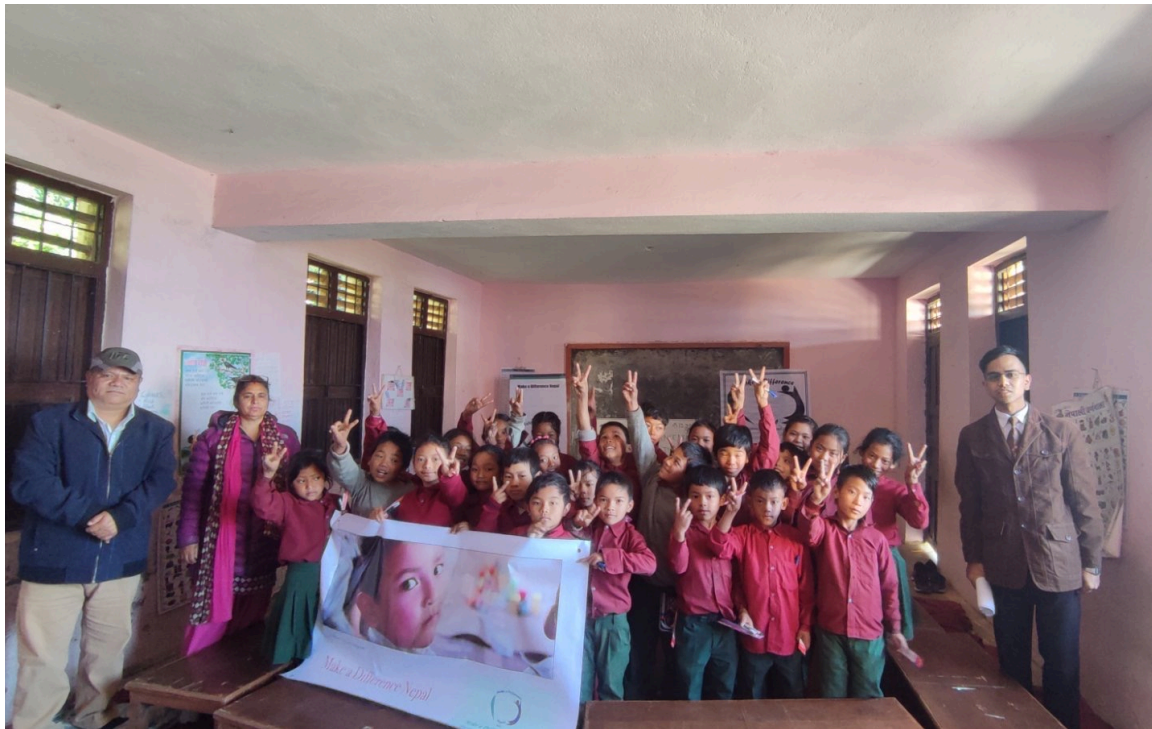
Group picture after completion of program